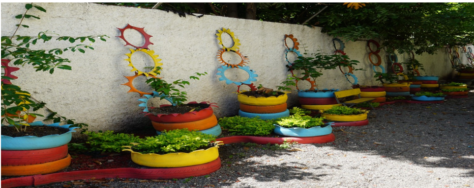
Holy Family Primary School placed third.