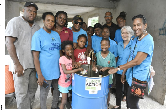
Members of the VPA present drums to the community of Cassava Piece in St Andrew .

"The VPA was invited to be a part of the discussion because of their continued presence and purpose in the community. One of the priority issues that came out of one of our weekly discussions was the matter of the poor management of garbage, not only the collection