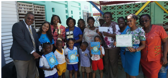
Naggo Head Infant School was second place winner.