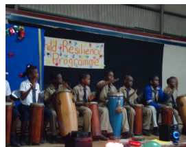
Cultural and Arts arm of the programme

The Child Resiliency Programme (CRP) of the Violence Prevention Alliance at the Kingston YMCA, Boys Town, Sam Sharpe Teachers College in Montego Bay and Falmouth All Age has accepted a new cohort of 220 children at risk of violence, exploitation and abuse for the academic year 2019-2020. Baseline interviews on all referred children to assess their level of risk and resiliency has now been completed. Children in their respective small groups have begun the