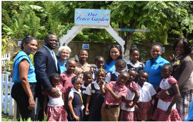
Prospect Primary School in St Thomas was the winner of the Trees for Peace Competition

Peace gardens will be judged in February to March of 2020 and cash prizes and trophies will be given to the top three schools.