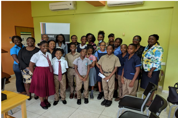
Representatives from winning schools in the INSPIRE Strategy Campaign.

The workshops gave the teachers and students a comprehensive overview of the INSPIRE Strategy and the information gained from the workshops enabled the schools to develop impactful campaigns to convey messages of the Strategy.